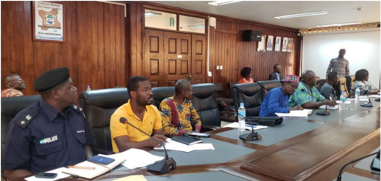
SLP Officer taking part in the Political Party Liaison Committee Meeting

This had enhanced the conduct of Free, Fair, Transparent and Peaceful elections.