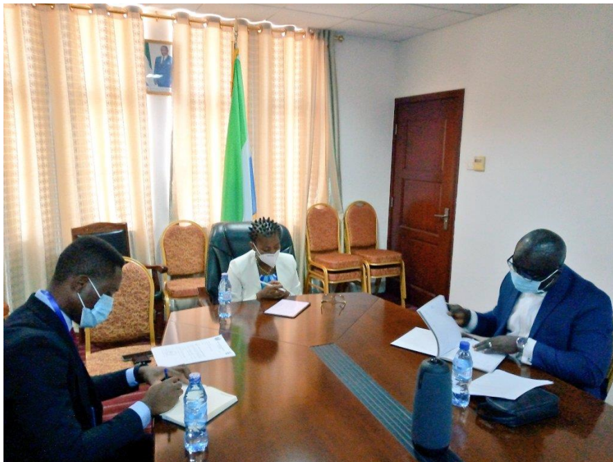
The CEC & Chairman meeting with Foreign Minister Nabeela Tunis

Another positive engagement to report is the meeting of the Foreign Minister on the 18th January, 2021. At this meeting, the CEC made a passionate plea to Hon. Nabila Tunis to help the Commission retrieve two vehicles donated by the Nigerian Government to the Electoral Commission since 2018 elections. After a series of exchanges, the two vehicles have finally arrived and are in the pool at the HQ.