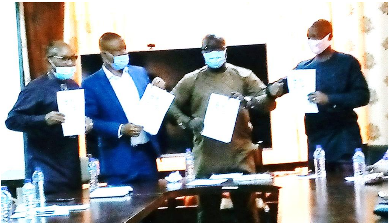
Signing of an MoU between ECSL and NaCEED