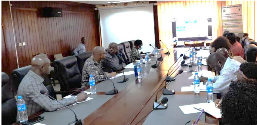
Virtual Training of ECSL Staff on Election Risk management Tool by IDEA-Int.

The outcome was mapping potential election risks and hot spots in order to mitigate and or address such risks.