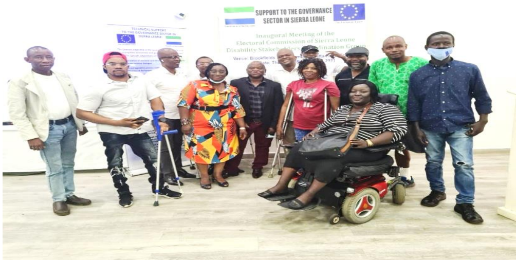
Inaugural Meeting of the Electoral Commission of Sierra Leone’s Disability Stakeholders Coordination Group.

The commission, as a way of responding to the current trends of genders, youths and physically challenged persons has created the Electoral Inclusion Department. This department, with support from the European Union (EU), has organized several training for the aforementioned groups and also established external coordinating groups for the physically challenged men and women. The essence of these groups is to improve on the participation of the minority groups in the electoral process.