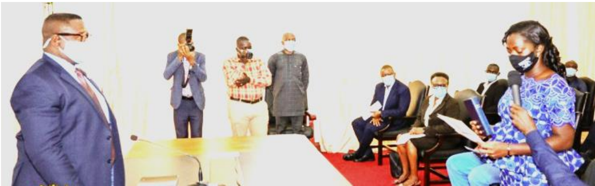
Electoral Commissioner for the Western Region subscribing to the oath of office before His Excellency President Dr Julius Maada Bio on Tuesday 16th November 2021

The president concluded by reiterating that: “ the ECSL as an institution doing a great job for our democracy to survive.” He congratulated her and wished her the best in her tenure of office.