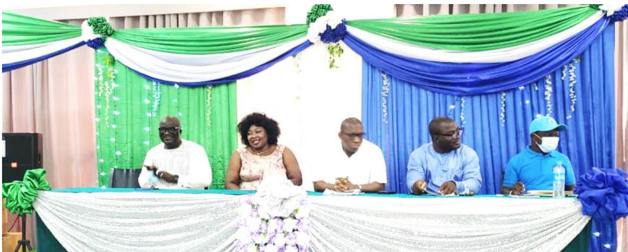
Launching of the Electoral Commission for Sierra Leone Staff Association 17th December 2021 at the New Brookfields Hotel in Freetown.

The staff association established in December 2020 was officially launched in December 2021 and has been very effective in promoting issues bordering the welfare of its members.