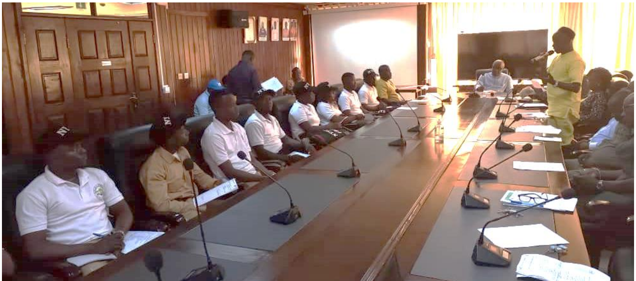
Director of Human Resource and Capacity Building addressing the National Youth Service Corps at the Orientation Ceremony