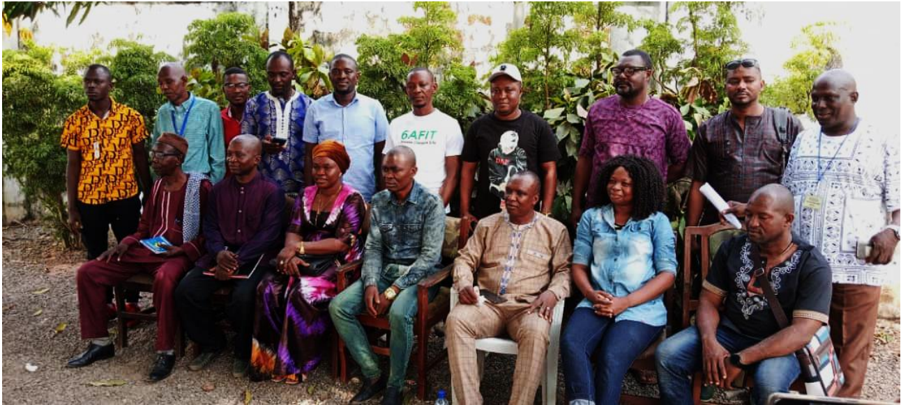
Members of the ECPMG after a meeting with Candidates and Community Stakeholders before a bye election