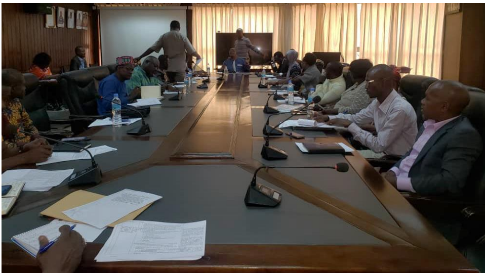
Political Parties Liaison Committee Meeting at the ECSL Conference Room Meeting

The objective of this meeting is to engage, discuss and update stakeholders on the conduct of electoral activities Before, During and After Elections.