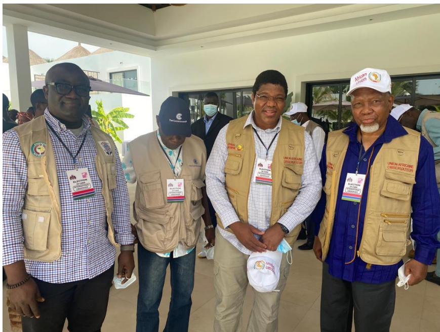
The CEC and Chairman on Election Observation with ECOWAS