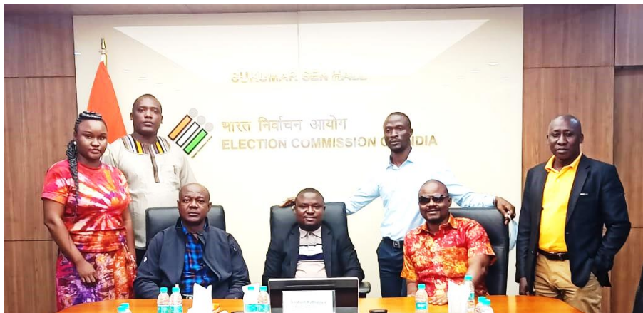
ECSL Team that benefitted from the Study Tour of India

Staff of the ICT and Data Management and Voters roll benefitted from a two-week Study Tour to India in September 2021 courtesy of the India High Commission to Sierra Leone. The objective of the study tour was a learning and experience sharing in a bid to provide staff with the requisite skills and knowledge in their fields of operation.