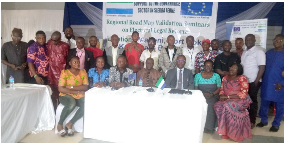
Participants at a Legal Reform Conference in Port Loko City