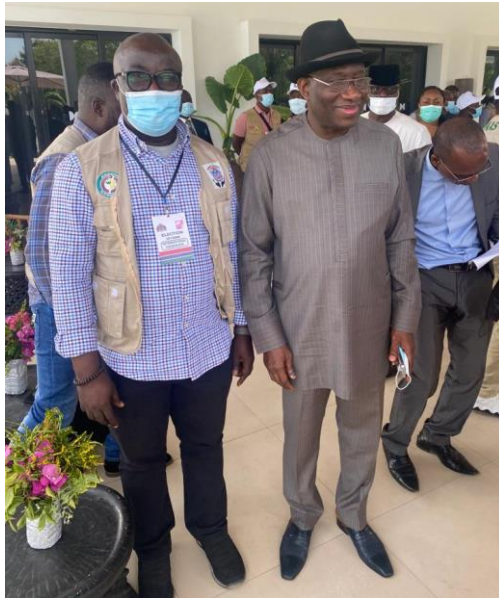
The CEC & Chairman of the EC-SL with the former President of Nigeria Mr. Goodluck Jonathan at an ECOWAS Observer Mission in the Gambia