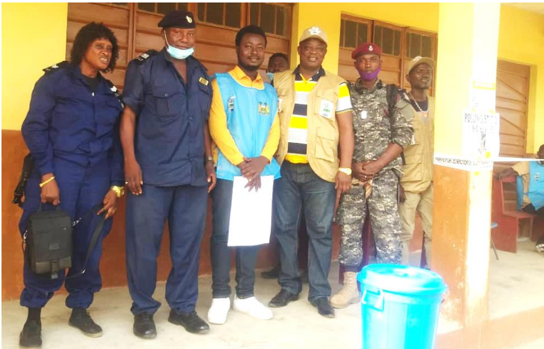
Monitoring of Bye-elections

This was aimed at enhancing Transparency and Accountability of the electoral process which had helped to boost the trust and confidence of stakeholders in the operations of the Commission.