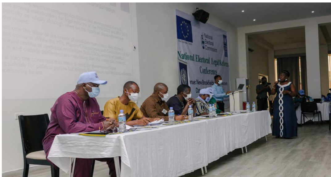
Members of the Discussion Panel at the Legal Reforms Conference