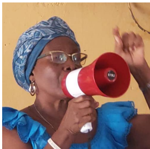
Female Town Crier carrying out Electoral Education exercise