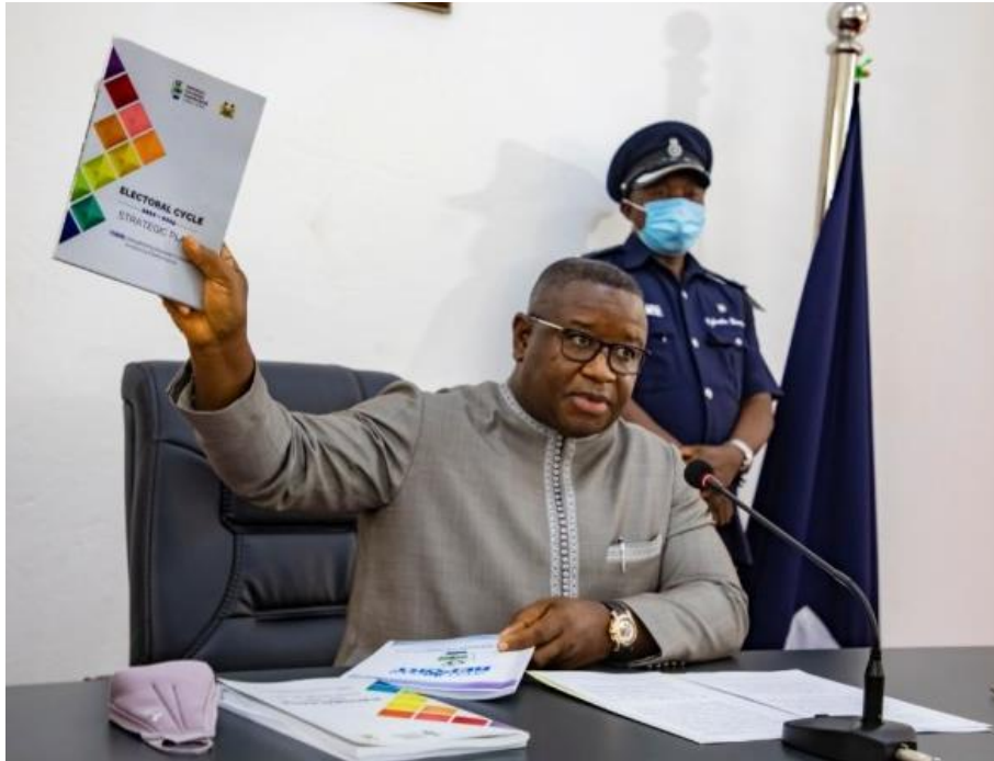
The CEC & Chairman of the ECSL presents the ECSL Annual Report 2020 to H.E. the President Dr. Julius Maada Bio