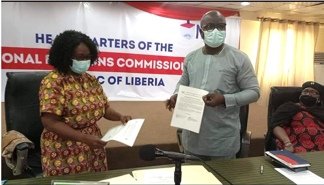
The CEC and Chairman of the ECSL signs a MoU with the CEC of Liberia Electoral Commission

Another successful diplomatic engagement was on the 18th of November, 2021 when the CEC led a team to meet with the Ghanaian High Commissioner at his Spur road office. Fruitful discussions were held and CEC was particularly fascinated by the Ghanaian Electoral Commission's strategy of result management and procurement method. The Chief Electoral Commissioner is still committed to a study tour to Ghana.