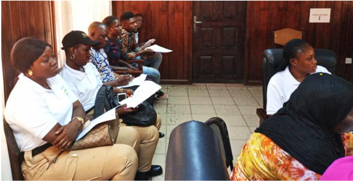
Orientation of Members of the National Youth Service Corps