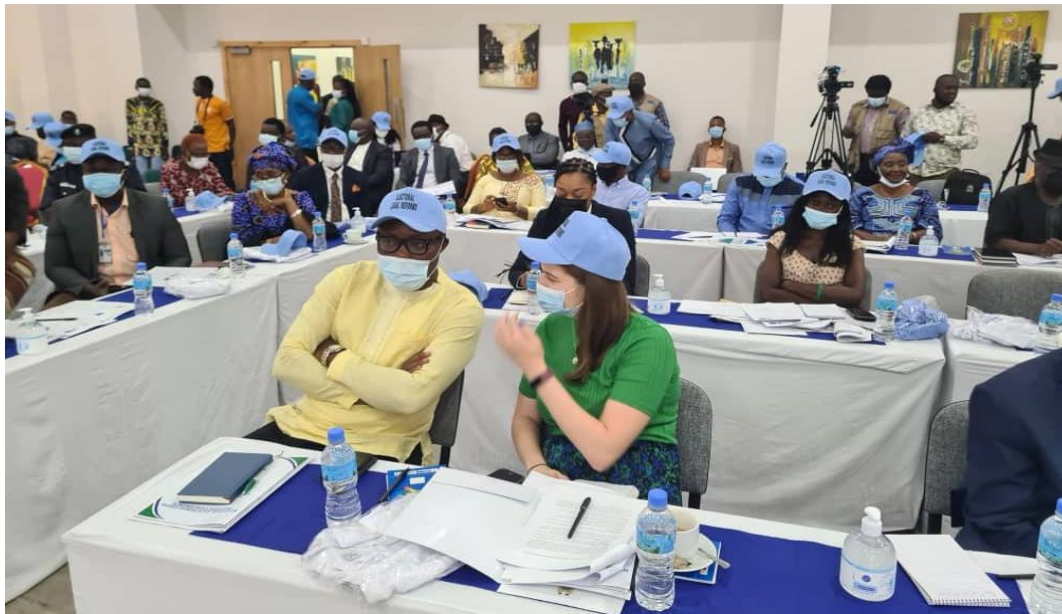
Legal Reforms Conference at the New Brookfields Hotel in December 2021

These reforms will improve on the integrity, accuracy and transparency and inclusiveness of elections in Sierra Leone.