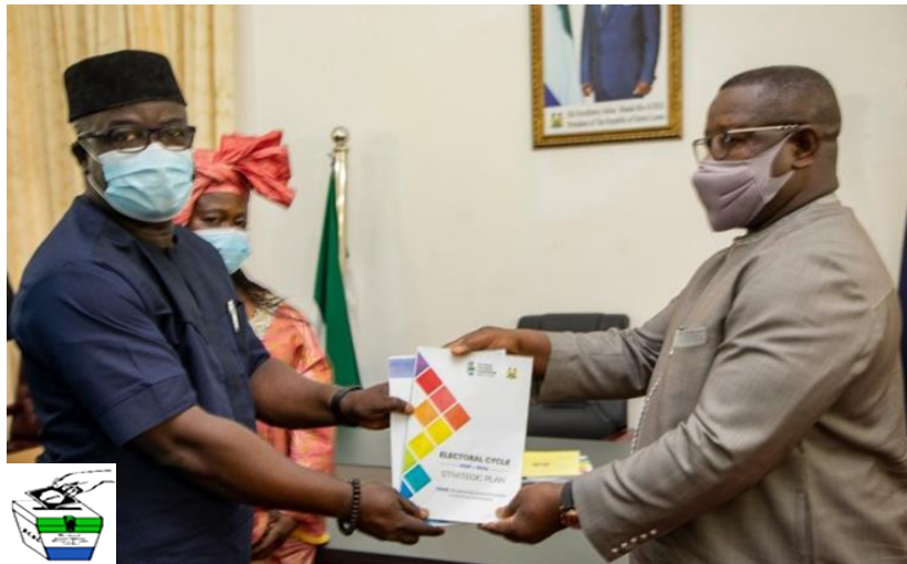
The CEC & Chairman of the ECSL presenting the SP 2020 to 2024 to H.E. the President Dr. Julius Maada Bio

After careful planning, the CEC together with fellow Commissioners and Staff launched the Strategic Plan on the 6th of May, 2021 which officially set into motion the Electoral Cycle 2020-2024.